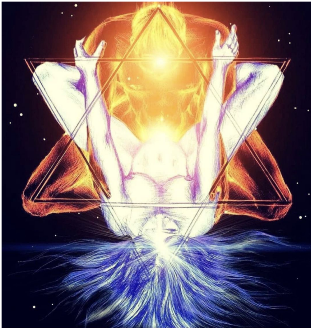
Father-Mother - Celestial-Terrestrial