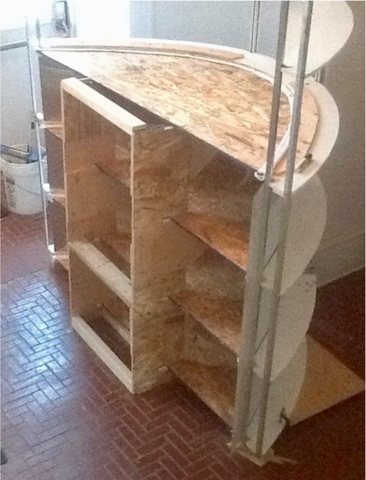
Attaching the mirror