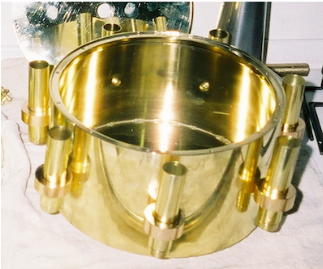
Inner Ring of Resonation