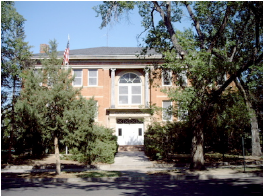
Pond Science Institute

"There is nothing in the range of philosophy which so satisfies the intellect as the comprehension of this wondrous system of sympathetic association , planned by the Creator of the celestial and terrestrial universe, for the government of all forms of matter ." Keely